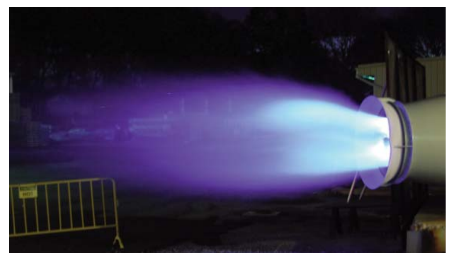
NovaStar NS150 firing natural gas at 140 MMBtu/hr

The burner produces a compact flame making it suitable for all drum sizes and types. This further reduces emissions by completing all combustion within the short combustion zone eliminating flame quenching from process materials.