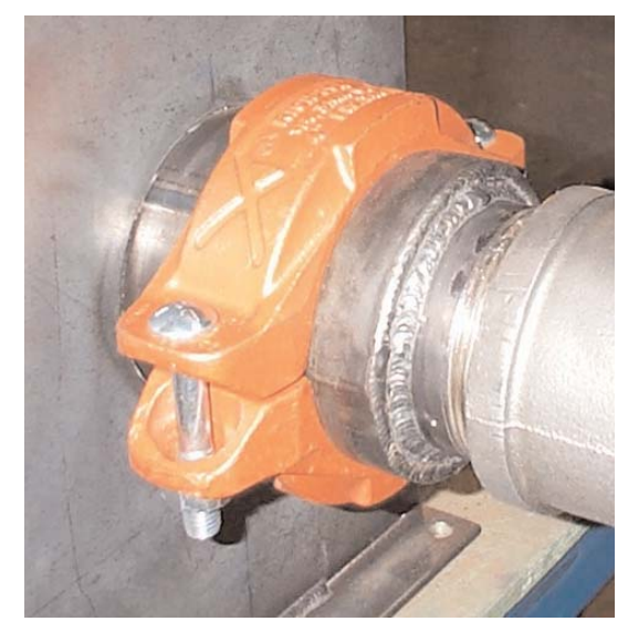
Grooved Couplings for Easy Removal and Cleaning of Heat Exchanger Tubes

The LHE's low watt density heat input permits the heating surface to operate at lower temperatures and thereby reduces coking and the frequency of cleaning and servicing. The heat exchanger tubes can be easily removed via the grooved coupling for cleaning of any coking buildup. If required, the heating elements can also be easily removed and replaced.