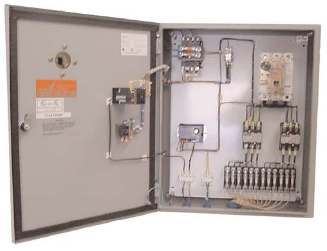
LHE UL Listed Control Panel

Each line heater unit is equipped with a digital electronic temperature controller. After the controller is set at the desired temperature, the line heater automatically controls the temperature of the oil, thus eliminating overheating or underheating. The oil temperature is measured by a thermocouple located inside the discharge end of the heater.